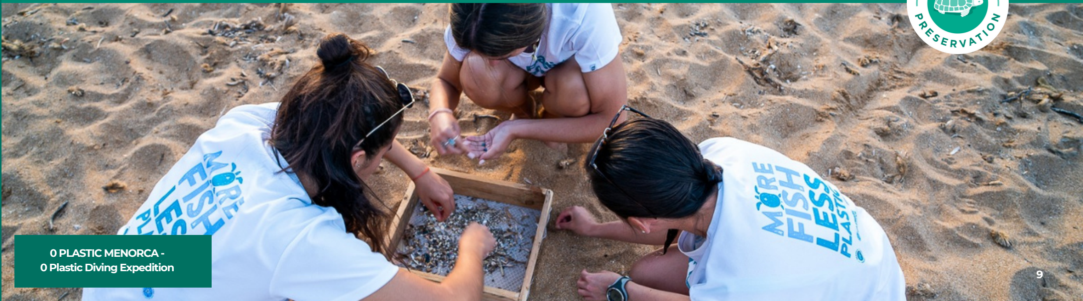
0 PLASTIC MENORCA - 0 Plastic Diving Expedition