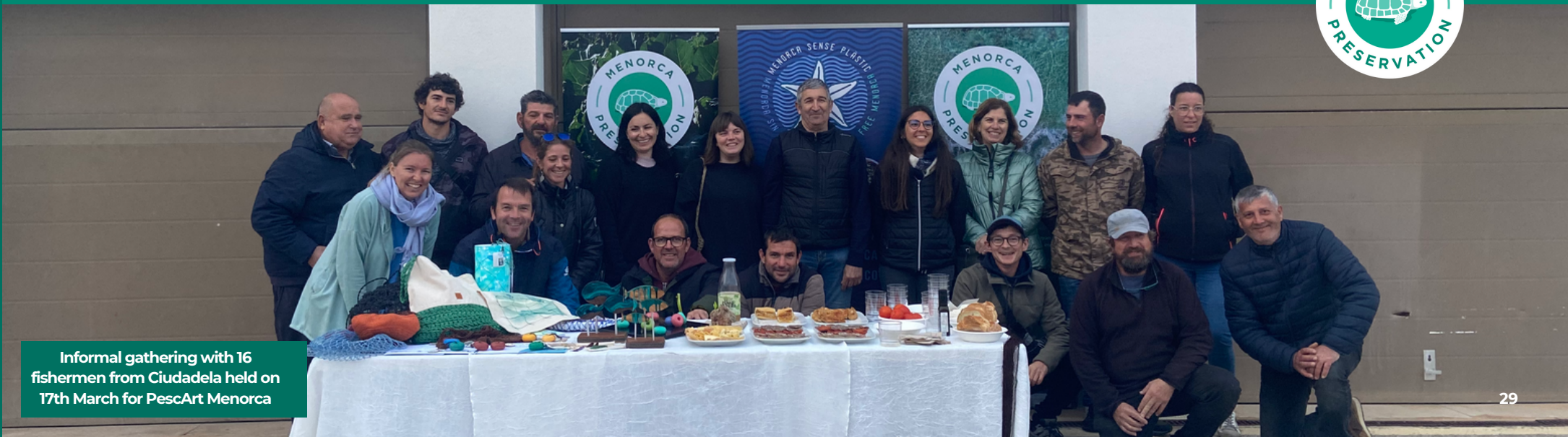
Informal gathering with 16 fishermen from Ciudadela held on 17th March for PescArt Menorca